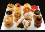
Assorted mini desserts