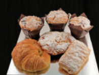
Assorted breakfast pastries