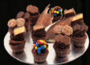
Petit four cup cakes