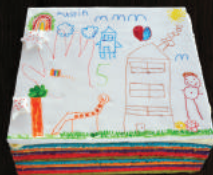
Children's Birthday cake