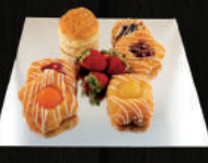
Assorted breakfast pastries