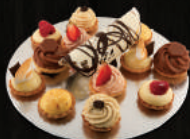
Assorted petit fours