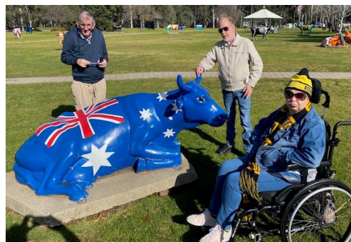
Mitchell Street residents visiting the Moooving Art cows in the park at Shepparton.