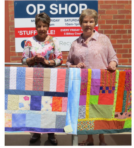
Thank you to the Rich River Quilters and Friends for another wonderful donation of quilts for some of our residents.