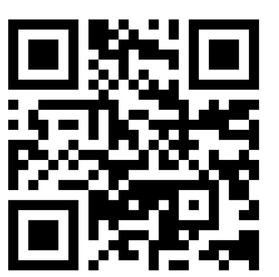
Scan this and tell us about your experience.