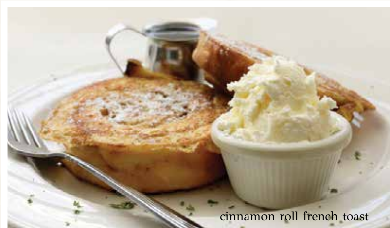
cinnamon roll french toast

2 of our bakery fresh cinnamon rolls, sliced & dipped in a blend of eggs, cinnamon & vanilla. Grilled & topped with powdered sugar. $12