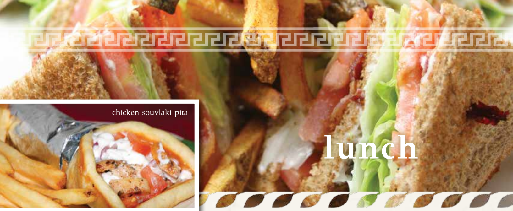
chicken souvlaki pita